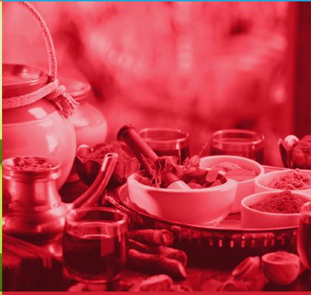
Medical Value Travel